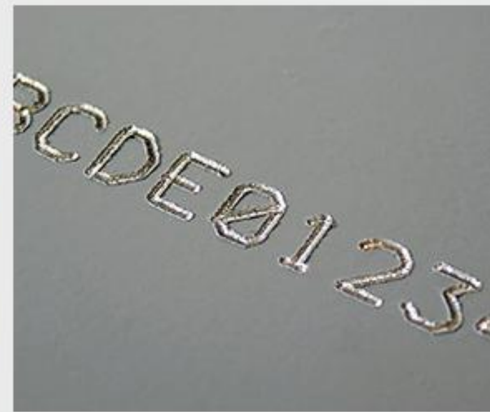
Deep marking on painted steel