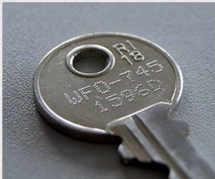
Reference data marked on a key