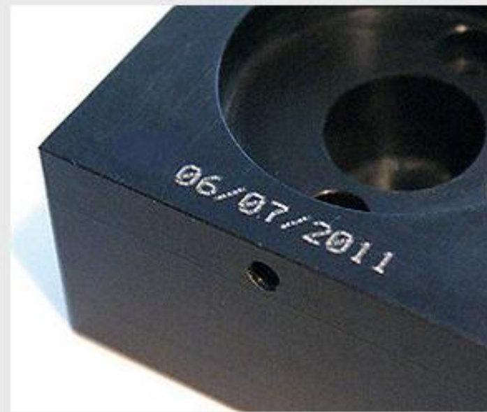
Date coding on an anodized aluminum component