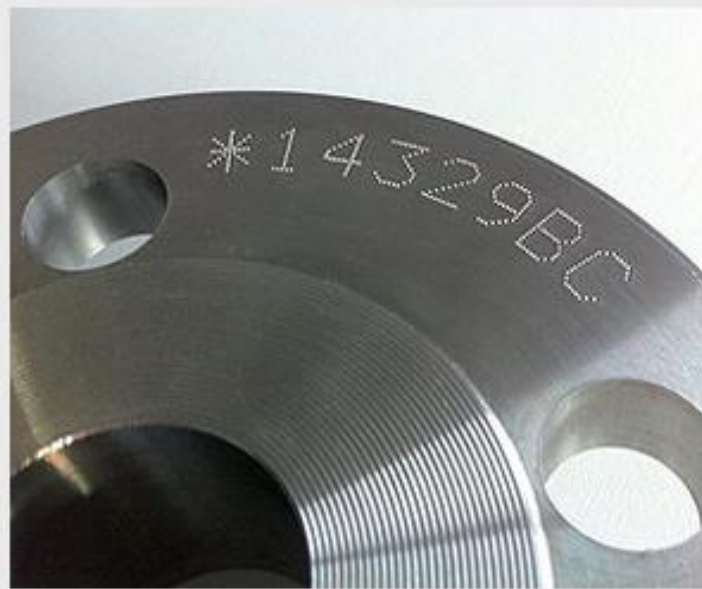
Serial numbering on a steel part