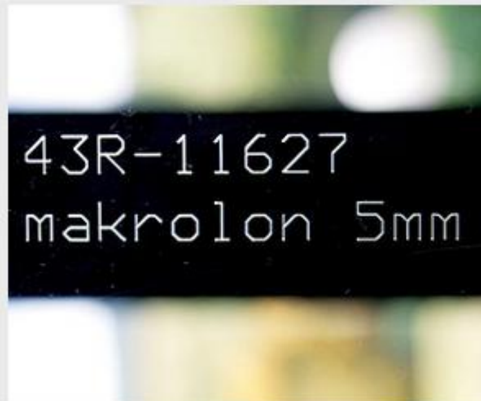
Serial number and text marked on a polycarbon support